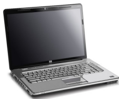
Free Computer Classes

Free Computer Basics are offered on Mondays; Internet Basics, on Wednesdays; and Word or Excel, on Fridays at 11 AM. Evening classes are held each Tuesday at 6 PM. Pre-registration is required.