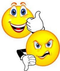
Thumbs Up? Thumbs Down?

“FREE BLOOD PRESSURE AND GLUCOSE SCREENINGS ARE OFFERED..”