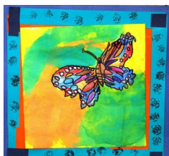
Student Artwork can be enjoyed throughout the library

On Wednesday, May 14, at 6:30 PM, the Friends will hold a special reception for the young artists and their family members. Students will