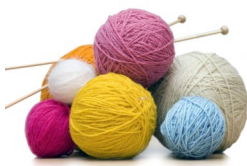
Knitters Meet First and Third Tuesday Each Month