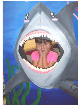
Bring your camera!

Saturday, August 2 is the last day to enter books for summer reading credit!