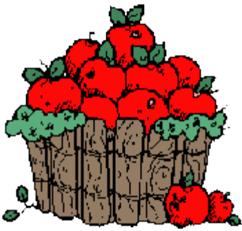
National Apple Month